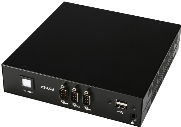
MS-9A78 with Haswell